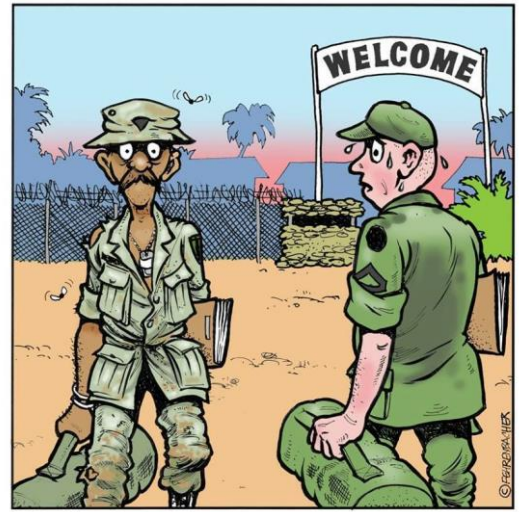
THE 1,000-YARD MEETS THE TWO-YARD STARE!